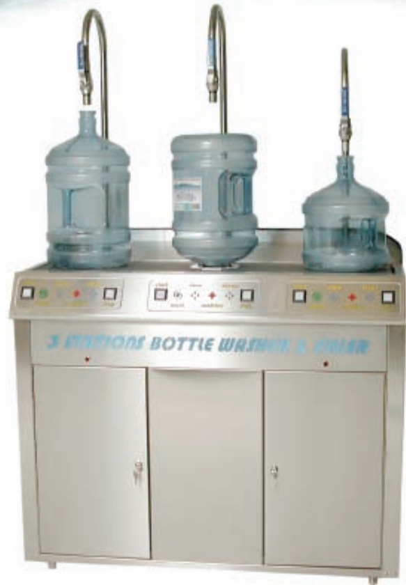
Dimensions: 46 1/4" (117.48cm) w x 37 5/8" (95.57cm) h x 23" (58.42cm) d Weight: 175lbs (79.38kg)

Attractively positioned in a water store, The BWF-3 allows a bottled water customer to safely and hygienically clean their own bulk bottles through a four step automated wash, rinse, sanitize and final rinse cleaning process. Following sterilization, the bottle can be easily positioned for pure water filling and taken home for enjoyment.