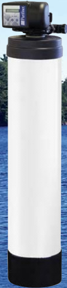
Shown With 2400 Valve And Optional Bypass Valve