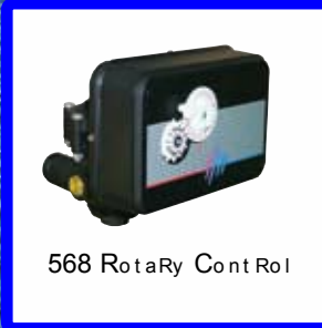
568 Rotary Control